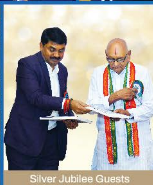
Silver Jubilee Guests