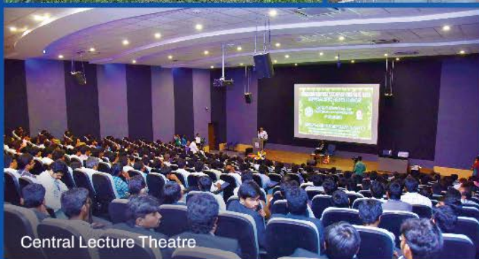
Central Lecture Theatre