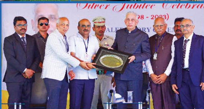
Silver Jubilee Celebrations 1988 - 2023