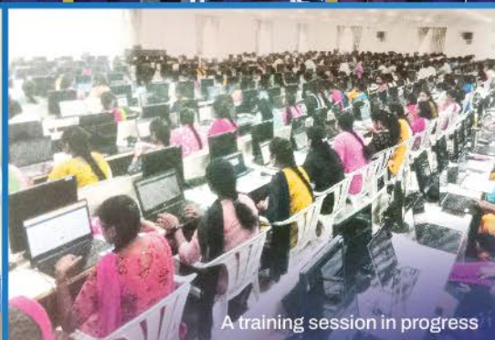
A training session in progress