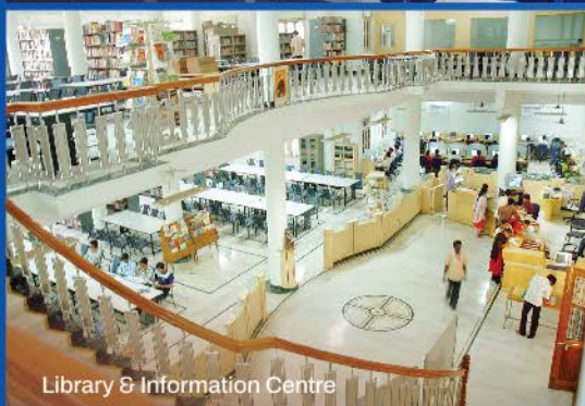
Library & Information Centre